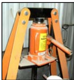
12 ton hydraulic press