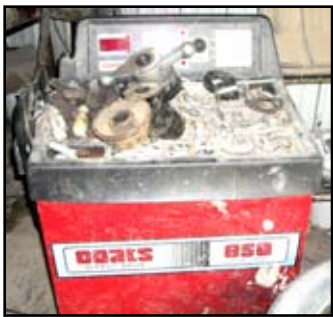
Coats model 850 tire balancer and asst tire tools, new wheel weight assortment and accessories