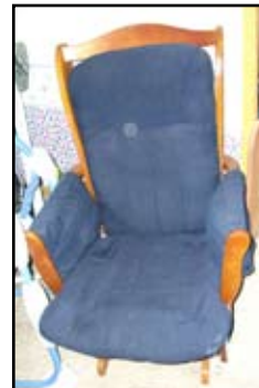
Upholstered glider rocker