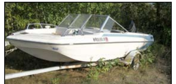
Glastron 16' fiberglass runabout walk thru deck. W/ trailer, 90 hp Mercury outboard

17' Fiberform boat and trailer with 90 hp Mercury outboard w/tilt and trim,