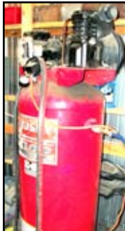
60 gal upright vertical shop air compressor