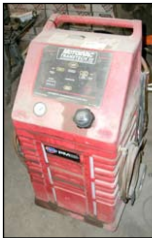
Motor Vac TransTech 3 Transmission service system/flusher