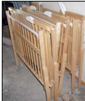
3- Wooden collapsible rolling cribs