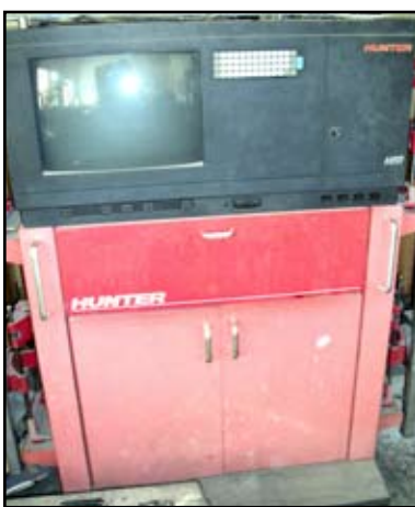
Hunter H111 Computer Alignment machine. Updated to 2008