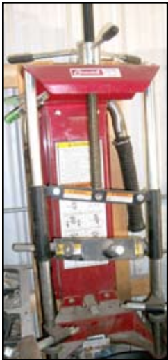
Branick model 7200 strut spring compressor like new