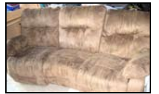
Curved couch w/recliner ends

One dozen children's nap cots, child's play chairs, some child's rolling walkers, activity peg board, baby changing station, toy storage bin table, bins of children's VHS movies -- Disney etc, poly high chairs, bin full of children's roller blades, bins of toys, stroller, divider wall