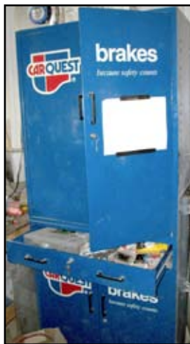
Big Carquest 2 story metal parts cabinet