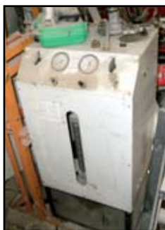
TC 670E Refrigerant management center draw down/pressure up, and canister of R22 refrigerant