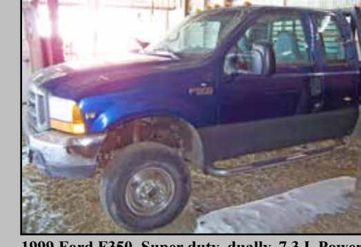
stroke diesel, super cab 4 wd, w/9' flatbed, goosespd manual trans