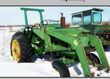
1970 John Deere 3020 diesel WF w/ JD 48 loader 16.9-34 rears, w/bale spear, 3 pt dual hyd's, double wheel weights, 4164 hours