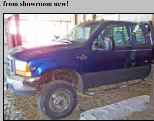
1999 Ford F350 Super duty, dually, 7.3 L Powerneck hitch, aux L tank w/ elec pump, 150k mi, 5