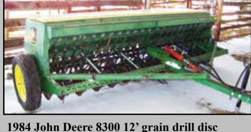
1984 John Deere 8300 12' grain drill disc openers, seed and fertilizer boxes look good,