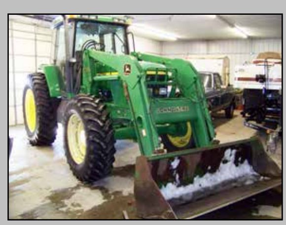
2000 John Deere 7510 Diesel Frnt whl assist, 2500 hours w/ JD 740 loader w/ bucket, 18.4-34 rears 14.9-R28 frnts all like new, 3 pt, PTO 2 hyd outputs