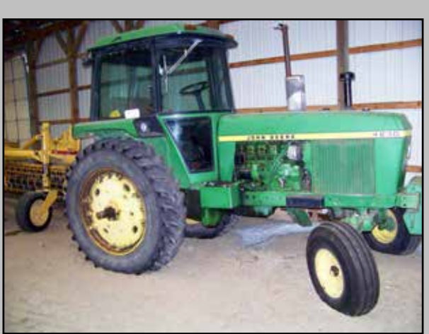
1974 John Deere 4230 diesel WF ser #19744R - 12 suitcase whts, 16.9X38's 60%, 540-1000 PTO, 2 spools, 4682 hrs, sound guard cab, AC/heat