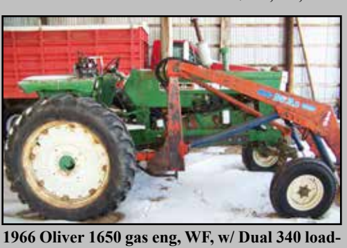
er w/ bale spear, 15.5-38 rears 3 pt PTO drawbar, PTO hyd pump, 6391 hrs