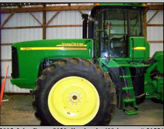
2005 John Deere 9120 diesel only 400 hrs ser # 31556 articulated 4wd all dualled up. double rear whl weights, 4 hyd outputs, command view cab, 20.8-42's like new all around, approx 230 hp at the drawbar, 1000 PTO, like new in every respect, AC/HEAT, loaded

ABSENTEE BIDDING: Folks, if you'd like to come and look at equipment prior to the Auction, give me a call, We want you to be confident about what you buy. If you can't make it for the sale, send someone as your Representative to bid in your stead and pay for the item on sale day, pick-up can be arranged for later. No phone or internet bids allowed. There will be loading available on sale day.