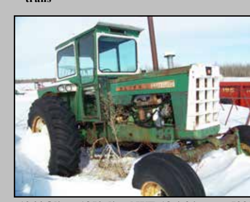
1966 Oliver 1850 diesel WF, 18.4-34 rears, 5230 hrs, w/ cab

New aluminum receiver mount handi cap cart carrier