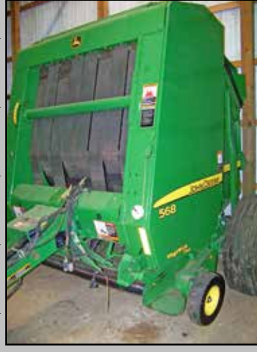
John Deere 568 round baler twine and