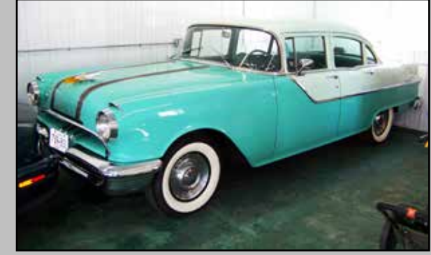
Immaculate 1955 Pontiac Chieftain 4 dr, 55k original mi, 287 cu in V8, auto, stunning and parade ready!