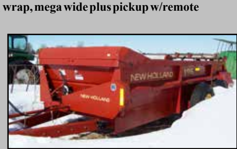
New Holland 195 manure spreader, only a few years old, very clean!