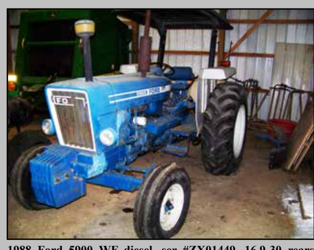
1988 Ford 5900 WF diesel, ser #ZX01449, 16.9-30 rears 50%, 1 hyd outlet, 540 PTO, drawbar, 2764 hrs, 6 suitcase