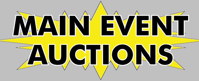
"We make your sale the main event"