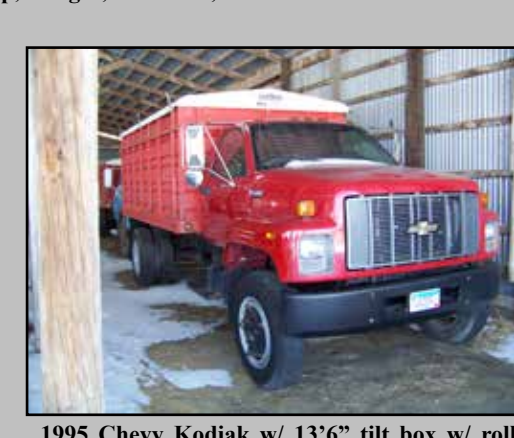
tarp, 7.0 liter gas eng, 116k mi 5 spd w/ aux