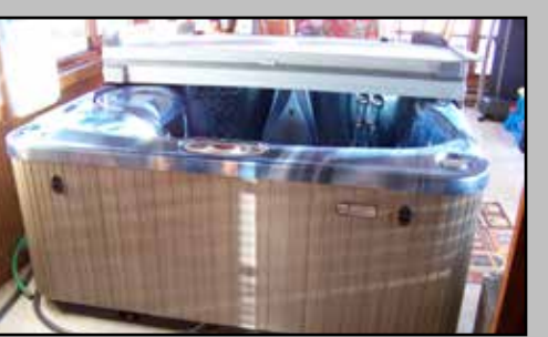
Like showroom new!...approx 4 year old, Hot Springs portable spa, used only 4 times, 4 person, this is a waterfall model, it has jets that can just about lift you out of the tub! Different color filters for the underwater lights, part of the Limelight collection, 240 v, Fold back insulated top, comes w/ step, all books, filters and chemicals!