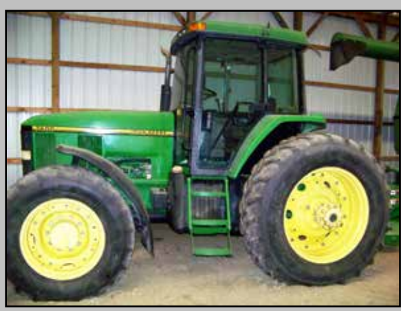
1996 John Deere 7400 diesel, ser # RW 7400 H 007500, frnt whl assist, Dual hubs on rear, 14.9-R28 frnts 70% 18.4-R38 rears 70%, approx 2000 hrs, 3 pt 540-1000