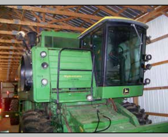
1979 John Deere Turbo 6620 combine set up for small grains, always used for oats, w/ 10' pickup header, excellent rubber, approx 2000 hrs, meter's been replaced