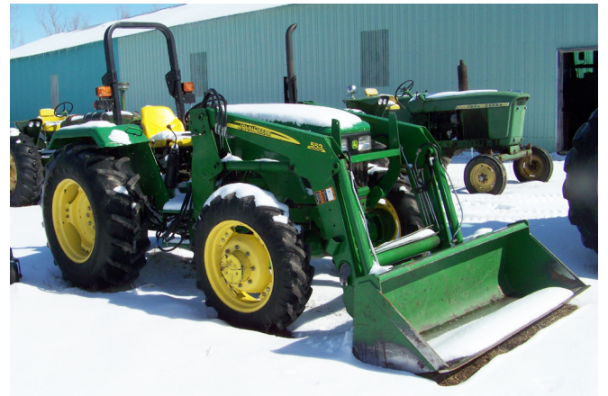
2013 John Deere 5055E 50hp 4WD Turbo Diesel utility Tractor w/ front end loader and bucket, 3pt, 540 PTO rear hyd outlets 9 spd partial synchro Trans w/ 3 spds reverse, folding ROPS, open station, rear locking diff, 2181 hours, Kept indoors like new rubber all around, 3 pt mnt ballast box will sell separate.

TERMS - CASH OR YOUR GOOD CHECK! Pay by conclusion of sale. No cards No I.O.U.s All items sold as is/where is, no warranty's given or implied and no returns allowed. All Items to be removed on sale day as the property is sold and a new owner will take over within days. Neither Property owner/ seller or auction company or crew are responsible for accidents or injuries. Although all attempts have been made by the auction company to accurately represent the items, some errors may be made. And the Auction company's statements on sale day may not reflect what was in the advertising. The Auction company and its crew will not be liable for any of these events.