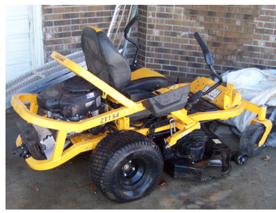
2020 Cub cadet Ultima T154 zero 1949 Ford 8N tractor nice shape turn riding mower w/54" Aeroforce exc rear rubber, 3pt, wheel deck and only 278 hrs Kohler 24hp weight are available separately