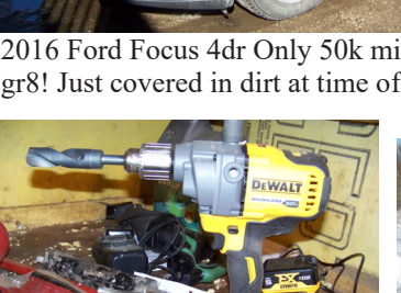
DeWalt 60V 1/2" drill w/ 9 ah battery and charger.