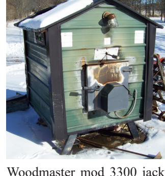
Woodmaster mod 3300 jacknedy half dollars and eted hot water heating wood burning stove or furnace. wedges, skilsaw worm dr 3 -40% silver halves, burning store and boiler. Firebox is tungsten stainless steel! This model is rated to heat tires, sharp shooter shovel, Morgan silver dollar up to 2000 sq ft building and Some sheet metal damage.