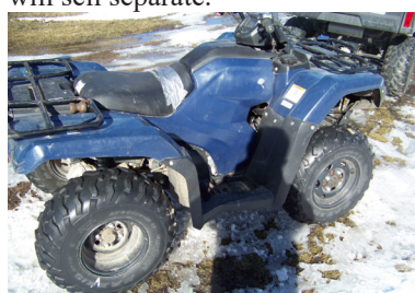
2016 Honda 420 Rancher ATV 2014 Polaris Ranger 4X4 UTV automatic, Power steering,1519 w/ROPS. Mod 570 efi, tilt bed, mi, runs and drives gr8! fuel injection, dual clutch technology, 4WD/2WD, good rubber. Winch is available and will sell separately.