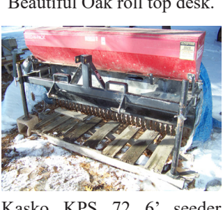
you can hang straight Kasko KPS 72 6' seeder Panasonic packer 3 pt mnt pretty good 32" flat screen TV shape kept covered, good for w/ remote, Old Time food plots and more this one ah battery and charger, like Nice aluminum fish plate box, Polka, Waltz's etc, a easily be changed, many acselection of house- cessories available, look it up shop vac, 6' green Werner hold goods, Cedar on the web, they run close to