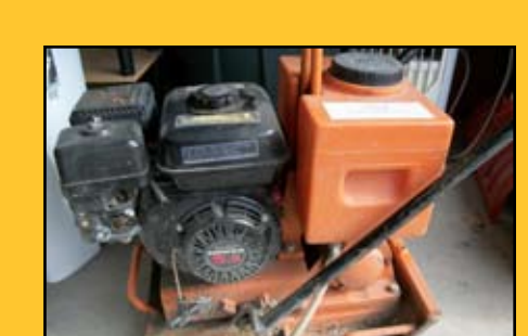
Gas powered plate compactor and an electric plate compactor as well