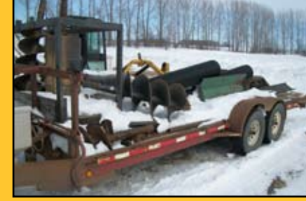
2002 22' tilt bed car trailer w/14' tilt and aluminum tool box mounted on tongue

We will start household at 10 a.m., move on to vehicles, trailers, Bobcat and equipment about an hour later, guns approx. noon, then on to tools and shop equipment to finish it out.