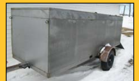
4 1/2' X 13' custom shop built all steel box enclosed single axle trailer.