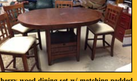
Cherry wood dining set w/ matching padded chairs

2 cases wire for rebar tie wire machine, MAX RB 395 tie wire machine, electric plate compactor, gas pwrd plate compactor, concrete trowels, several bull floats for cement work, power screed, gas powered concrete saw, rebar cutter, mobile home anchors, concrete curb and gutter forms.