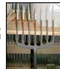
2- dark house spears.