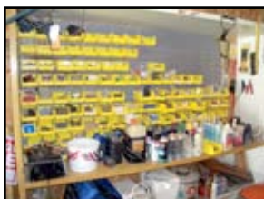
Nuts, bolts and parts bins, Buyer removal on sale day, bring tools.