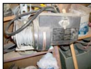
Super winch X3 12 volt winch 4,000 lb capacity.