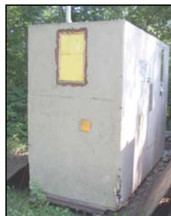
Spear house and stove.