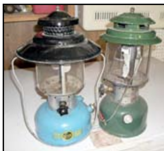
Sears large shade and Coleman lantern also lantern by "Sun Flame."