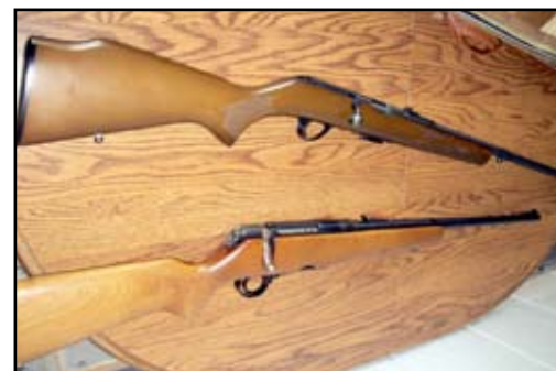
Stevens 30-30 Bolt action Rifle- Stevens Mod 35 .22 Bolt Action.