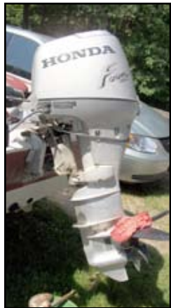
2004- 25hp Honda 4 stroke, goes with boat.