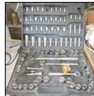
Many tool sets and mechanic's tools.