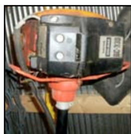
Magnum 33cc Mod 107 Ice Auger.