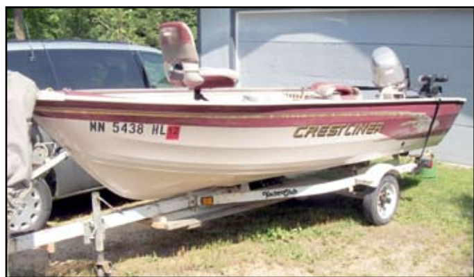
14' Crestliner 14 Angler w/ Yacht Club trailer ... 2006 - 25 hp Honda 4 stroke, Minnkota power drive 665 28 lb thrust elec. trllng mtr w/boat cover.