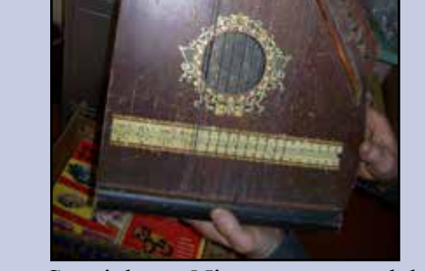
Special Niagara model harpsichord