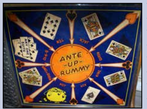
Old children's games

Bavaria plate, and more collectible glassware