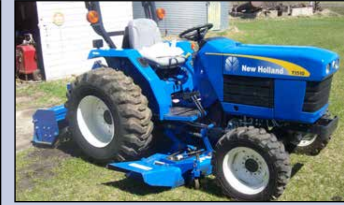
2 year old New Holland T1510 compact tractor like brand new w/ only 109 hours, front wheel assist, Hi Lo range, w/ belly mower, diesel, ROPS, 3 pt, TO BE SOLD SEPARATLEY- Like new WOODS TS52 - 5<sup>3</sup> rototiller, pto dr/ 3 pt mnt