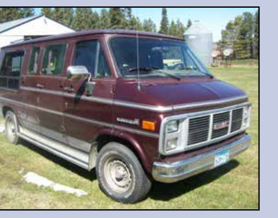
1989 GMC Vandura 2500 conversion van, tow package, 5.7 ltr runs good