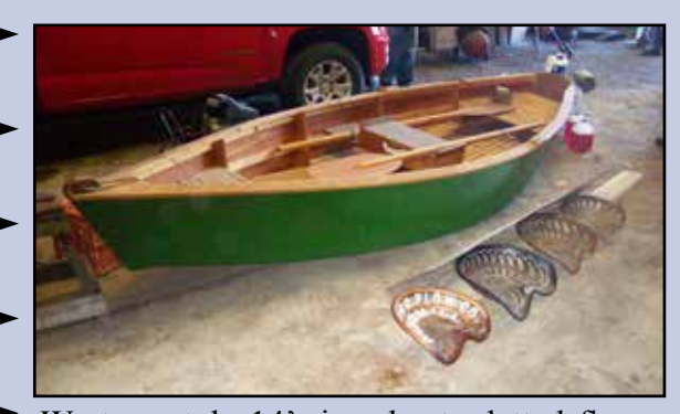
Western style 14' river boat, slatted floors, highly rockered, said to have been built in Erskine, appears to be new and of a high quality build