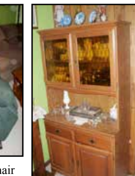
Berkline lift chair in lifted position China Hutch

Sectional sofa. Note: All upholstered furniture is ultra clean, no smoking and no cats allowed in here!