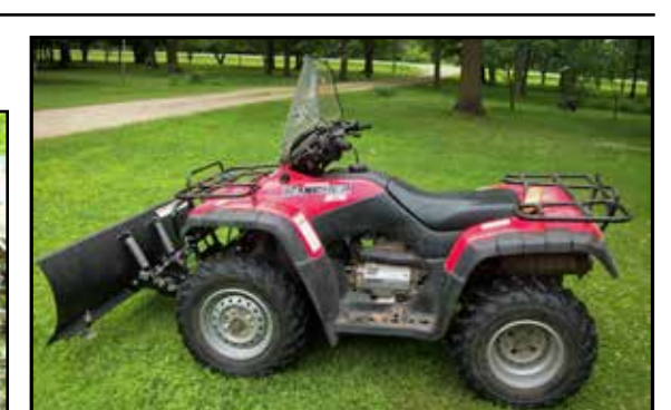
2002 Honda Rancher ES 350 4x4 w/ new plow, senior driven, like new with only 1900 slow miles and 500 hours on the meter

Asst ammunition, 20 rd mag for M14, 2 mags for Rem 742, Schrade LB7 Bear paw folding knife, Imperial small Bowie. S&W revolver grip, etc, Leupold M8-4X scope w fine crosshairs, and one piece mount and rings, Law Enforcement Duty belt, w/ tear gas holder, handcuff holster, small revolver holster, black jack, uniform hat.