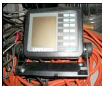
Lowrance X20A Fish locator.