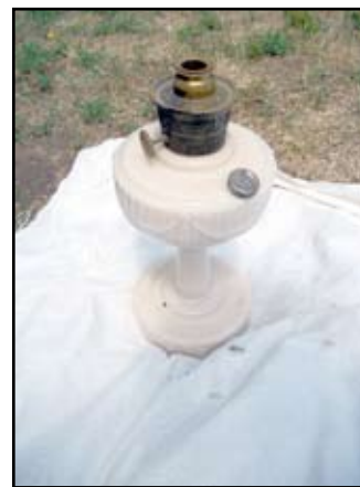
Lincoln drape kerosene lamp (pink).