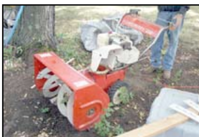
Jacobson 8hp snow blower.