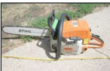
Stihl 029, brand new, won't start.