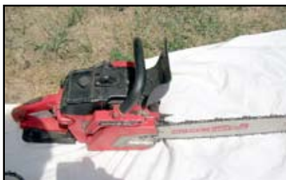
Jonserud, runs good.