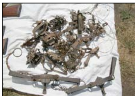
Many traps, some very collectible such as a Triumph #42 flat chain with teeth.