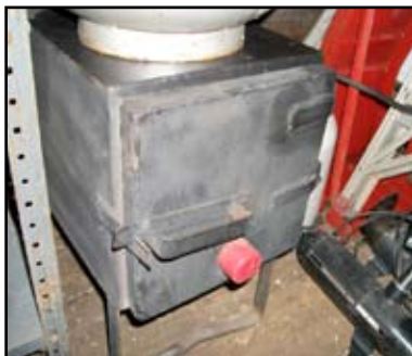
Heavy gauge small steel wood burning stove.

This is a "LIVE" Auction No absentee or internet bids accepted. NO buyer's premium.