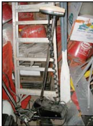
Minnkota power dr bow mount trolling motor.