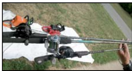
Fishing rods and reels.