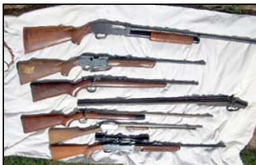
Collectible Firearms to include Winchester 67A .22LR, Winchester 68 .22 LR, Winchester 1906 .22 ser# 352637, Remington 7400 30-06 w/scope, An old side by side rifle shotgun combo barreled action, JC Higgins 2 3/4" 12 ga Pump, Daisy BB gun.