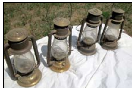
Kerosene lanterns, some of them brass.