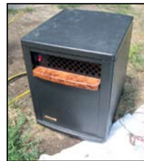
Small Eden Pure heater.

Spearing decoys, asst ammo, a small mountain of life jackets, duck and geese decoys, fish house stoves, electric trolling motors, plastic outboard tank.