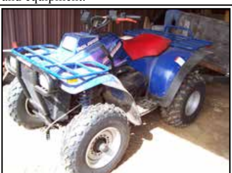
1994 Polaris 4x4 425 only 1,347 mi, runs good and new 4's now blade available as well