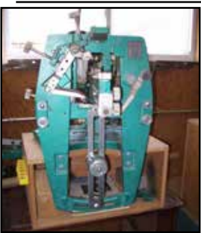
Entire Foley Belsaw circle saw blade professional sharpening system, go into business for yourself with these items! Several more pieces and accessories that are not pictured. Foley Belsaw mod 387 bench top circle saw blade sharpener