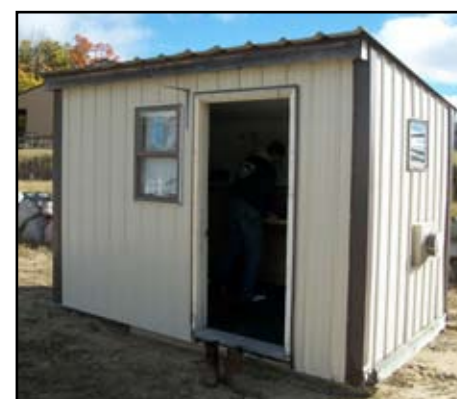
7'x12' 4 hole Fish house, Empire vented heater, 2 bunks, 3 burner stove. on skids.

John Deere 48" Commercial walk behind mower 14hp Kawasaki engine, power flo bagger, 52' tine dethacher, w/mulch kit.