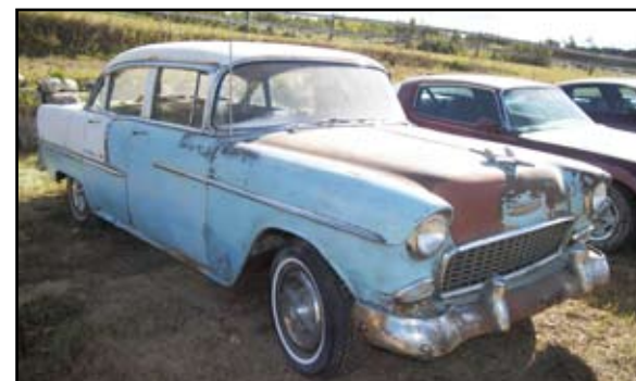
'55 Chevy Belaire 4dr 6 cyl, auto w/title.