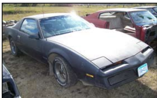
'83 Firebird 6 cyl auto, runs w/title.