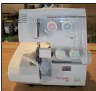
Bernette 43/43D overlocking Serger