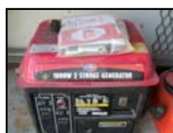
1000 watt generator

Asst feeders, stock tanks, tank heaters, horse blankets, halters, harness