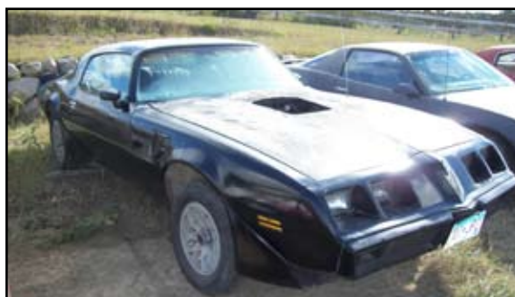
'80 Trans Am, No motor or trans w/title