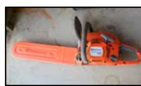
Husqvarna 240 chainsaw