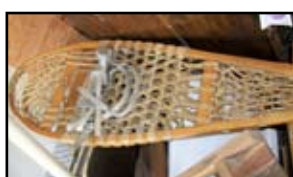
Michigan style snowshoes.