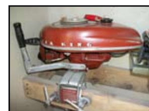
Vintage Sea King outboard like new

Utility cart, 2 wheel trailer, JD broadcaster, Hand tools.