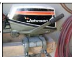
Johnson 4 hp outboard