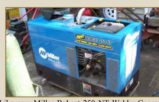
Like new Miller Bobcat 250 NT Welder-Generator 20 hp 250 Amp 10k watt CC/CV AC/DC stick welder and Miller SGA 100c spool gun control and cart (adds wire feed capability to the welder)