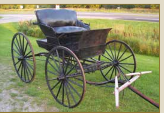
Horsedrawn buggy, Emerson Brantingham Co.