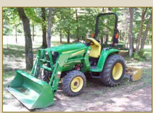
New John Deere 3025E compact tractor w/ loader, front wheel assist, ROPs, 3 pt, PTO,