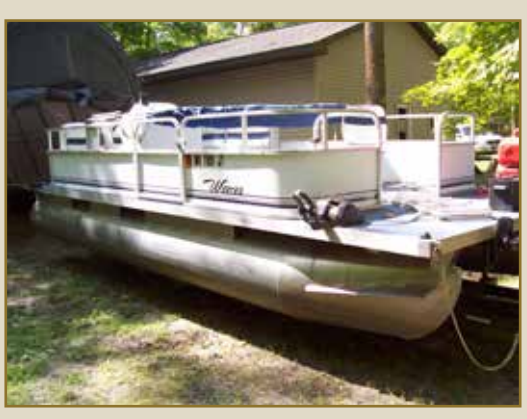
Super clean 2004 Weeres 20' pontoon w. 25 hp Johnson 4 stroke and 2010 cantilevered trlr,

Directions; From Bemidji MN go West on US Hwy # 2 to the Junction of #89 NW, Turn right & go North 6.4 mi to sale on left, 9328 Lefse Lane NW Bemidji, MN 56601 Note: From the rare and never before seen private firearm collection to the like new industrial woodworking equipment, collector car, top quality DR brand lawn and garden machinery and more, this sale is the "cannot miss it" EVENT of