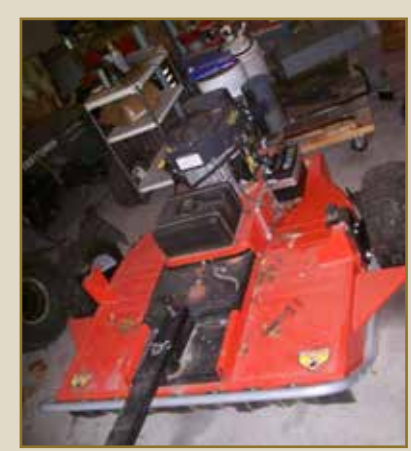
DR pull type rotary mower (bush