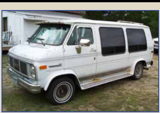
'89 GMC Vandura 2500 conversion van, shows 49 k mi, loaded, all electric, TV, deluxe stereo, 4 plush captain's chairs, rear bed, Trailer package, like new rubber