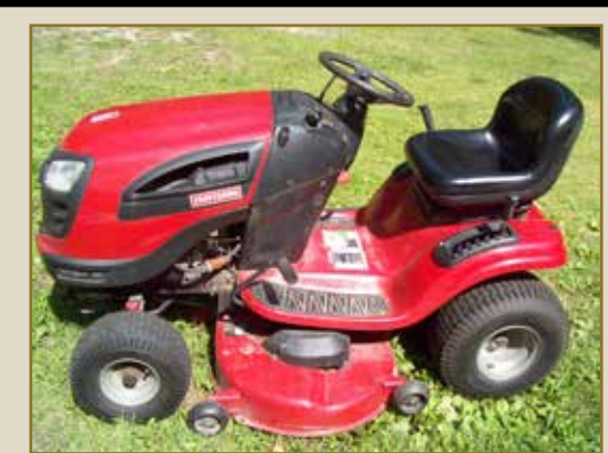
Like new Craftsman YT3000 riding mower