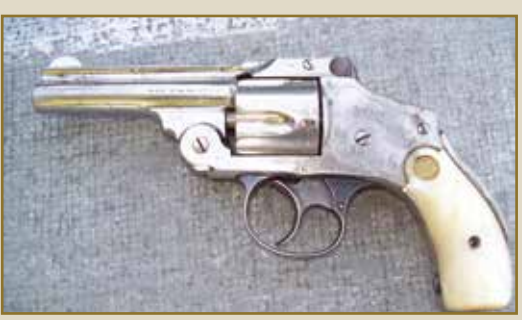
S&W Safety Hammerless breaktop .38 S&W lemon squeezer w/ pearl grips marked W.F. And CO. NEVADA (Wells Fargo) ser # 160155