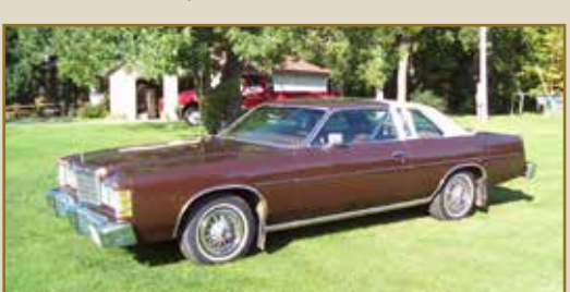
Pristine 1977 Ford LTD 2 door, 14,556 actual mi! Always stored, original rubber on it, original battery included, runs great, 351 M 2 brrl VIN # 7P62H180888