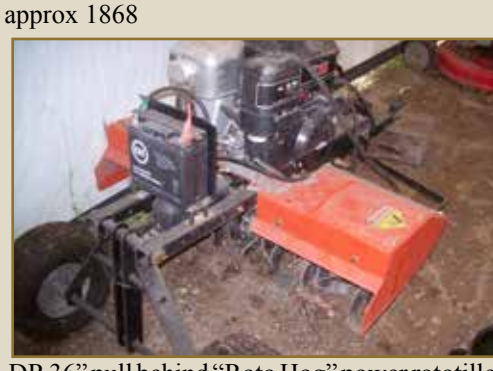
DR 36" pull behind "Roto Hog" power rototiller