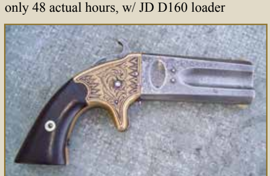
American Arms Boston Mass Wheeler patent derringer, rotating barrel .22 short/ .32 short over under, engraved brass frame ser # 566