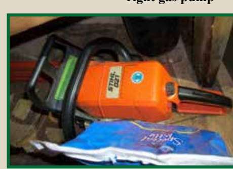
Stihl 021 chainsaw