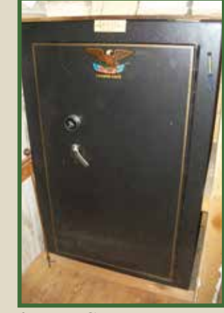
2- large Cannon brand gun safes

IRON BUYERS... You wanna be at this one!