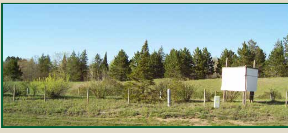
3 % commission offered to participating Brokers or licensed agents, call for details

Real Estate terms: Property sold to the highest bidder subject to owner's confirmation of the final bid. 10 % must be paid down upon signing the purchase agreement. This is non-refundable if buyer is unable to close by the closing date. A personal Representative Deed to be given on day of closing. Buyer to pay closing costs. Closing to be on or before July 17th 2017. Land to be sold by legal description only. A 3 % buyer's premium will be charged to the Buyer. Further information and terms will be given at sale time.