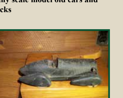
Collectible wooden and tin cars