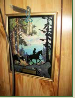
Walikonis Store Reserve Montana advertising piece, plus advertising thermometers etc