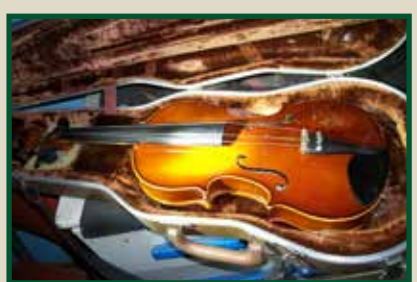
serial # 51266 fiddle made in Ger-

shop vise & table, many come alongs, shop compressor, manual tire changer, several handyman jacks, welding hoods, Miller Thunderbolt 225 stick welder, Battery starter/ charger, Cambell Hausfeld 70 amp stick welder, DeWalt 4 1/2" angle grinder, several tool chests full of tools, heavy 10 ga SO ext cord, dozens of galvanized Culligan water tanks, several piles of dimensional lumber, Werner 6' step ladder, Minnesota license plate collection, 2- pedal grinders, crosscut saws, Old Cabin Still advertising thermometer, circle saw and arbor, large equipment winch, Many Many steel implement wheels, collectible old 5 gal oil cans, treated posts, several cords of split stacked hardwood gas lamps figurines etc, ACE tap and die set, shelves full of gun and firearm