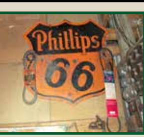
Phillips 66 metal sign, Goodyear Tire metal sign, Univerzol Oil lighted sign, Red Crown Gasoline metal sign and several other advertising pieces

Rockefeller once said "If you want to get rich...buy land on the edge of a growing city in the direction of its growth...and wait..." This axiom has proven itself true, and here is YOUR opportunity to do the same, and I don't think you'll have to wait long to reap the benefits of this investment!