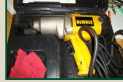
DeWalt 1/2" electric impact wrench